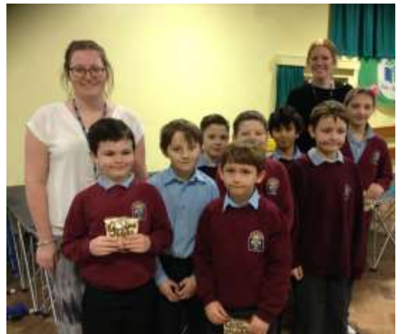
Here are the winners of our dragon hunt!

Our fantastic dragon hunters managed to find all six dragon eggs hidden around the school to earn themselves and eggggcellent prize! Great job guys!