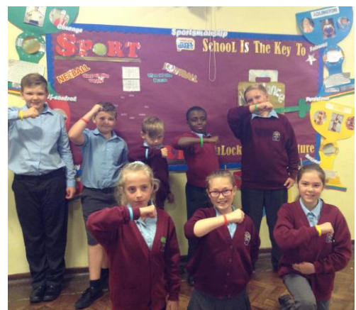
Our Upper School Captains: