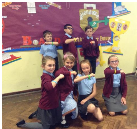
Our Lower School Captains:

Please meet our new Sports Captains! Representing their respective houses, Hamilton , Adlington , Mclroy and Ennis .